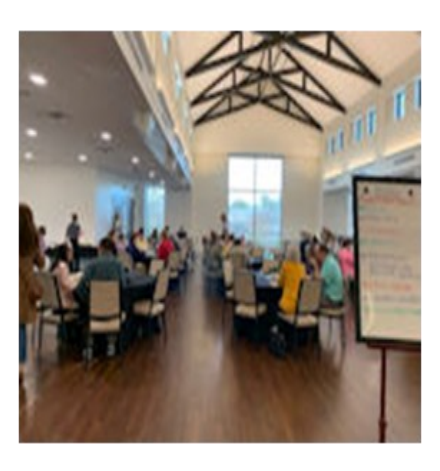
Parish Enjoying Brunch